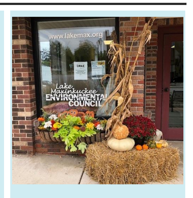
Fall Decorating Looks Great!

Working towards the preservation of an ecologically sound Lake Maxinkuckee and its surrounding watershed.